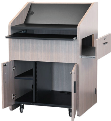
Console Top Shown

Top rear removable, intended to easily be mounted in a wedge position or as flat large work surface, that can support monitors laptops and room control systems.