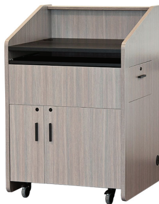
Flat Top Shown